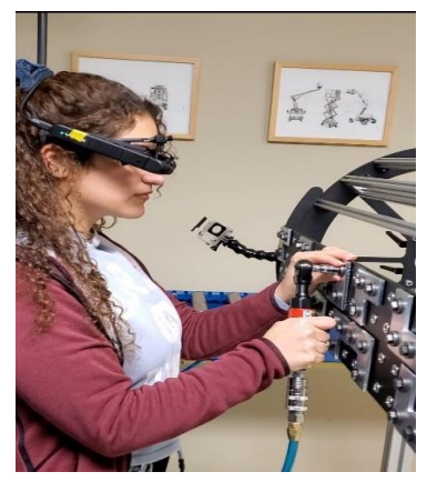
Figure 1. Assembly of brackets on a simulated plane engine using smart glasses

illustrated in (Figure 2). Before beginning with each participant, a brief tutorial on how to use the tools and components was provided. The participants had to select the appropriate bolts between the two types provided based on the instructions. For the first two scenarios, both the instructions and an image of the final assembly were printed on paper and attached to the jig above the plate they needed to work on. For the third and fourth scenario, the same instructions and image of the final assembly were filmed for upper limb movements with 2 GoPro Hero 3+ cameras which were located on the jig on both sides of the participant, and the time was measured with a chronometer and confirmed by the cameras. A Pupil-labs core eyetracker was also used to track eye movements.