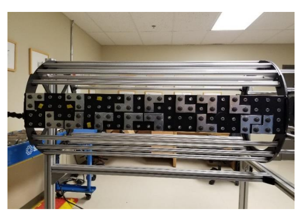
Figure 2. Assembly jig designed at ETS

More in depth analysis for this experimental data remains to be done and will be presented in a peer reviewed journal paper in writing.