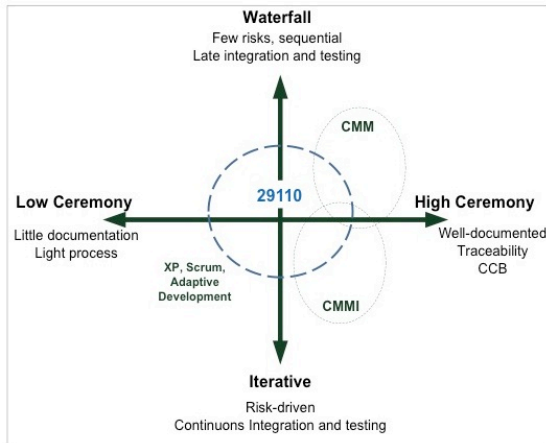
Figure 1: Positioning of the ISO/IEC 29110 (adapted from [Kro03])

level of risk. The top axis illustrates a low risk linear approach using a waterfall approach while the lower part of the axis illustrates a risk-driven project using an iterative approach. ISO/IEC 29110 is located at about the center of both axes.